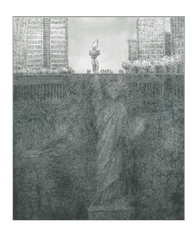
Liberty Landfill Plaza 2016 Pen and ink wash on paper 60,96 x 45,72 cm © James Wines