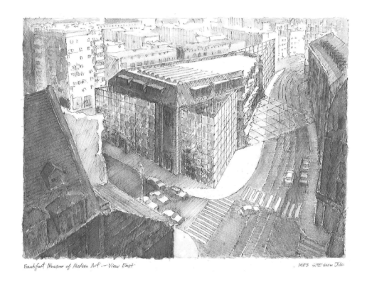
Frankfurt Museum of Modern Art – View East 1983 Pen and ink wash on paper 20,32 x 25,4 cm