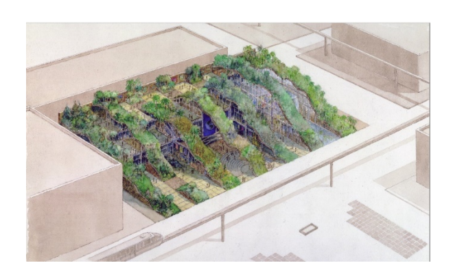
World Ecology Pavilion – Expo '92 1990 Watercolour on paper 38,10 x 60,96 cm © James Wines