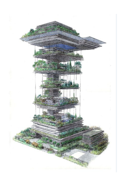
Residence Antilia-Mumbei 2004 Watercolour on paper 41,91 x26,67 cm © James Wines By courtesy of Malcolm Knapp