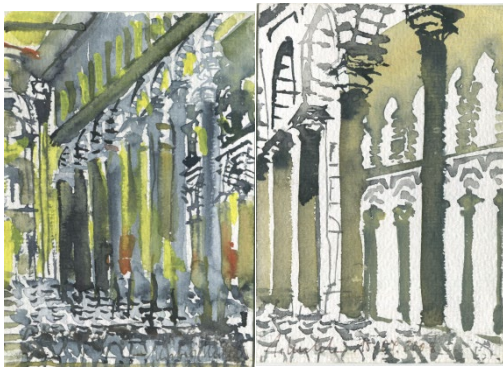
San Lorenzo in Genoa 2008 Watercolour on paper 15 x 21 cm Loan of the artist