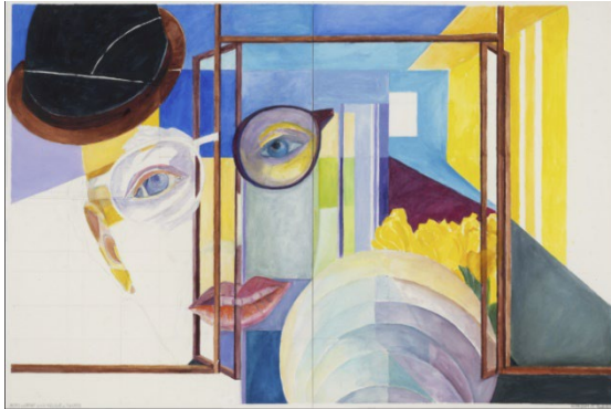
Mies van der Rohe with Bowler Hat and Tulips 2021 Watercolour on paper 61 x 92 cm Loan of the artist