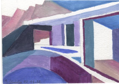
Bungalow Famara, Lanzarote 2022 Watercolour on paper 10,5 x 15 cm Loan of the artist

Tchoban Foundation Museum for Architectural Drawing