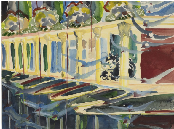
On the Quay of Siracusa 2007 Watercolour on paper 36 x 51 cm Loan of the artist