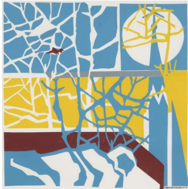
February Morning 2011 Collage 46 x 46 cm Loan of the artist

Tchoban Foundation Museum for Architectural Drawing