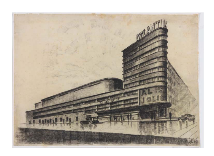
R. Rettig Cinema Atlantik 1930 Charcoal, pencil, on tracing paper, on white cardboard 56.8 \times 78.5 \text{ cm}